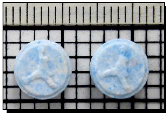
Photo 9 (Top Scale Tick-Marks are Millimeters; Squares are 2 x 2 Millimeters Each)

The DEA Northeast Laboratory (New York, New York) recently received 12 round, mottled blue tablets with a “Michael Jordan” logo, suspected Ecstasy (see Photo 9). The exhibits were acquired by personnel from the DEA New England Field Division at a locale in Massachusetts (exact location and details sensitive). Analysis of the tablets (total net mass 3.2 grams) by GC/MS, LCMS, GC/FID, and FTIR/ATR, however, indicated not MDMA but rather 1-benzylpiperazine (BZP; 78.7 milligrams per tablet), ketamine, 1-(3-trifluoromethyl-phenyl)piperazine (TFMPP), 1,4-dibenzylpiperazine, and caffeine (only the BZP was quantitated). This is the fifth time within the past year that the Northeast Laboratory has seen BZP. Tablets with the “Michael Jordan” logo have also been previously submitted to the laboratory, but none of the previous tablets with this logo contained BZP.